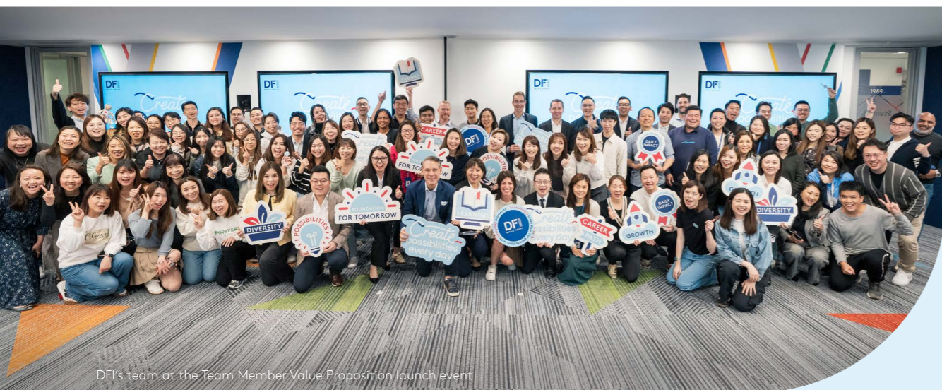
DFI's team at the Team Member Value Proposition launch event