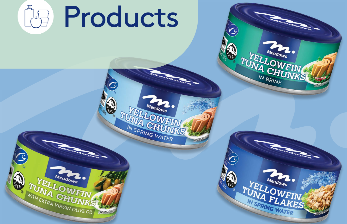
Our Own Brand — Meadows MSC-certified canned tuna range

The products we provide across our operations are at the heart of our customers' daily lives. For each of our 13 markets, customers demand diverse assortments of products and brands that best address their personal needs. Fundamentally, consumers want more sustainable products in their lives at accessible price points, while also want to ensure their needs for product quality and safety are met. Sustainable products should be both better for the planet and better for customers, contributing to better livelihoods while minimising environmental impacts of both DFI and our customers.