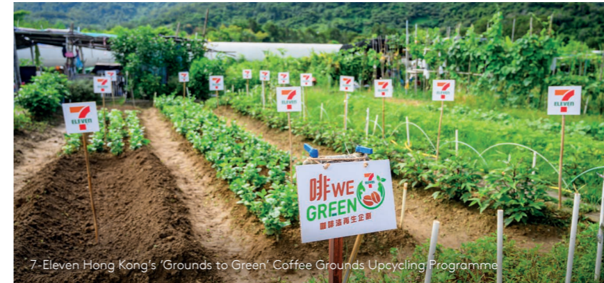
7-Eleven Hong Kong's 'Grounds to Green' Coffee Grounds Upcycling Programme

This year, we developed a cross-format initiative by using coffee grounds from 7CAFÉ to introduce a new coffee canned stout beer, producing 24,000 cans out of 870kg of surplus bread and 589kg of 7CAFÉ coffee grounds in this collaboration.