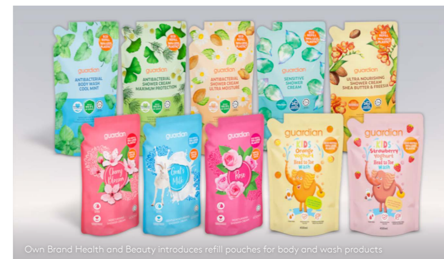
Own Brand Health and Beauty introduces refill pouches for body and wash products

In addition to our goal of making all Own Brand product packaging recyclable by 2030, we are also implementing initiatives to promote the use of reusable packaging. Guardian Malaysia introduced refill pouches for popular Own Brand body